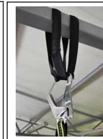
Figure 2 Overlapped