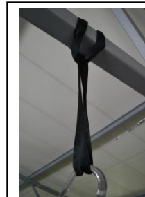
Figure 1 Choker Hitch